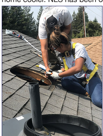
NLS team installing a tubular skylight.

tremendous amounts of light while maintaining your home's temperature. Our solar attic fans help to silently dissipate hot air from your attic, helping to keep your home cooler. NLS has been operating in Sonoma