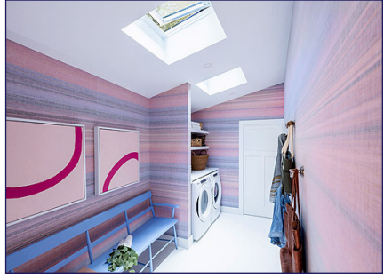
Skylights from Naturalight Solar can completely transform a space.

people still think that skylights let a lot of heat into your home, but with advances in skylight technology, high quality brands such as VELUX skylights are very energy efficient. Quality tubular skylights provide